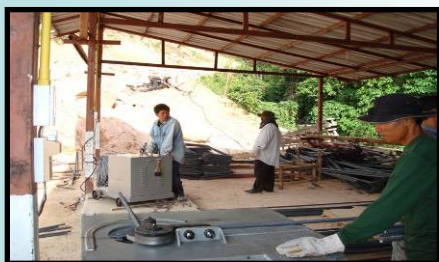
On-Site reinforced steel bending and cutting.