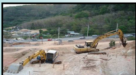
Two Caterpillars preparing upper tier site area.