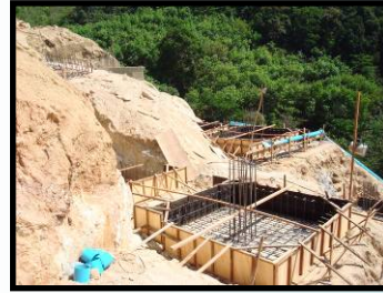
Block A5 Structure footing (Jan 2008).