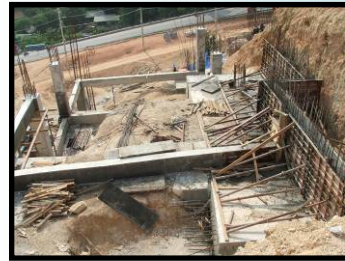
Block A5 progress (mid Feb 2008).