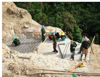
Workers placing reinforced concrete foundations in the granite bedrock at 60m above sea level. (Jan 2008)